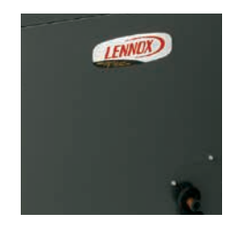
CBX40UHV AIR HANDLER